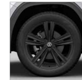
20" Sebring dark graphite matte for R-Line