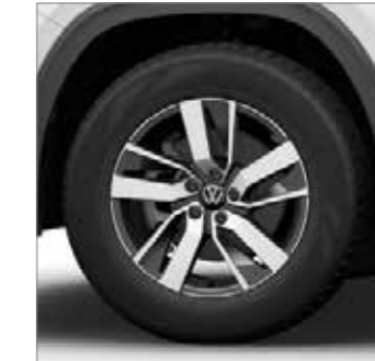
18" Titan machined