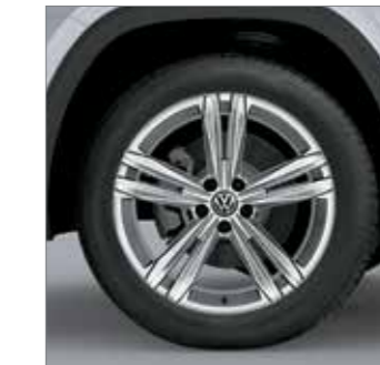
20" Sebring silver