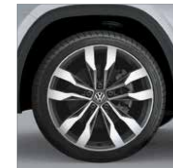
21" Braselton for R-Line

Not all combinations of exterior paint and interior seating surfaces are available. Colour range is reproduced for illustration purposes only. Actual on-car colours may vary from those shown, screen technology does not allow exact reproduction of the paint colours.