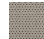
Shetland White Quartz