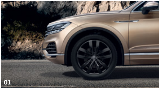
01 The stunning 21-inch 'Suzuka' alloy wheels add a unique finishing touch to the Touareg R-Line.

By design, the Touareg R-Line could not be better equipped, both inside and out, to handle whatever lies ahead. Numerous exterior features emphasise its dynamic character, from the distinctive 20 to 21-inch R-Line alloy wheels, 'C' signature 'Gloss Black' front air intake and 'R-Line' exterior styling pack with specially designed front and rear bumpers, body-coloured wheel arch protection, side skirts, and 'R-Line' badging on the front panels and front grille. The 'R-Line' styling ensures a dynamic exterior that delivers the highest levels of style and individuality.