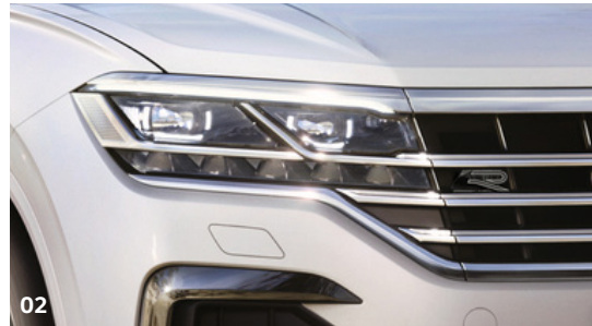
02 The unique 'R-Line' badging on the radiator grille sets yet another sporty accent and underlines the striking exterior design of the Touareg R-Line.